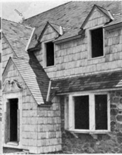
Copper flashings which cannot rust are used generously on the roof.