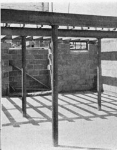
Steel girders at important points give rigidity and a firm structure.