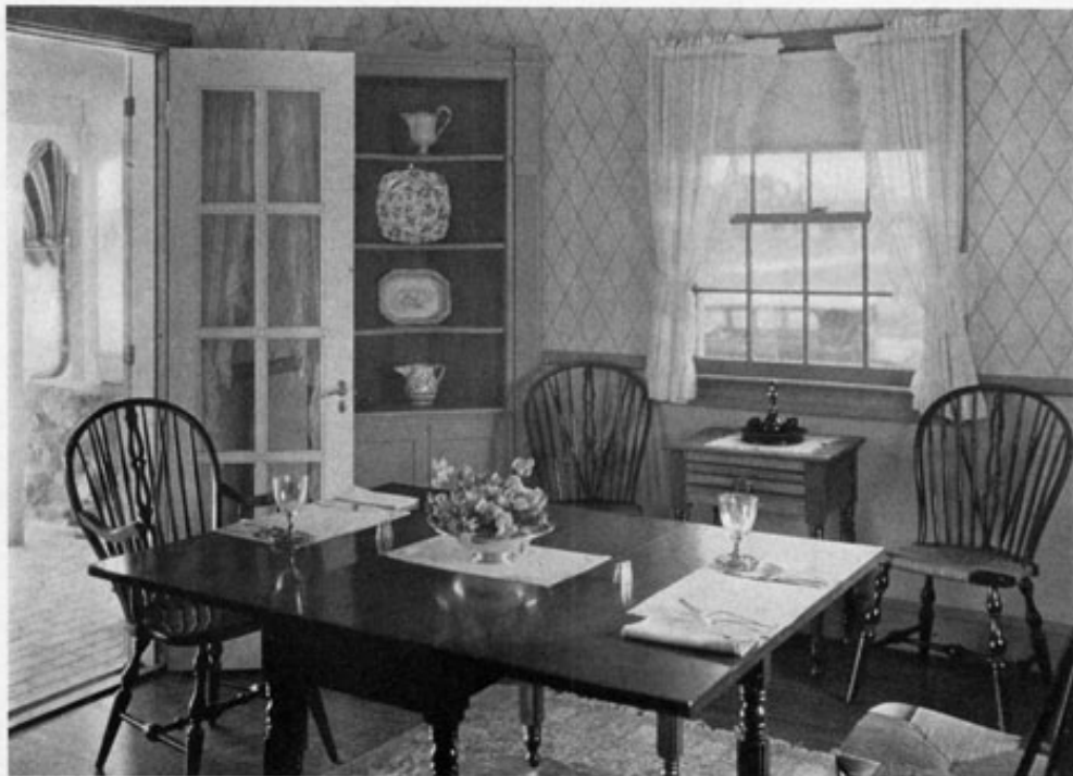
"... a charming corner cupboard is both a useful and decorative feature of the dining-room."