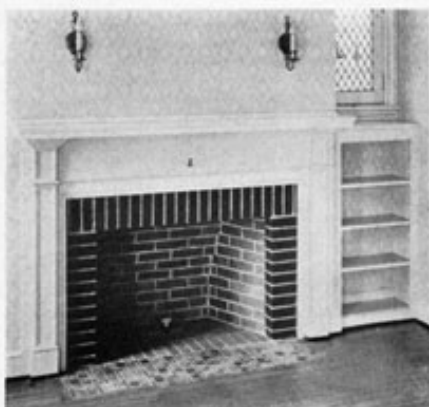
Typical open fireplace of excellent proportions, with ivory finished Colonial mantel.

best of all, an open fireplace of excellent proportions, with perhaps a red brick hearth and an ivory Colonial mantel of unusual simplicity, promises the fulfillment of your dreams of a winter's night at home.