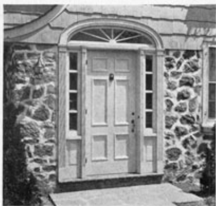
This Colonial entrance is typical of the best in Early American architecture.

Each room is tastefully decorated; each has been carefully planned to provide cross ventilation and a spacious clothes closet. And each room offers a challenge to the modern housewife to arrange a bedroom interior far beyond her fairest dreams.