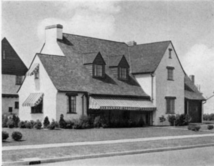
Widely varying architectural types produce a harmonious effect due to skillful architectural planning.