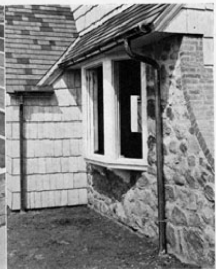
Sixteen-ounce copper gutters and gutter pipe are a feature of every home.