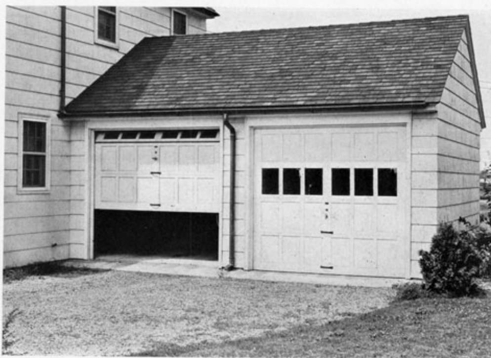
Overhead garage doors ... one of many added values.

"...bathrooms are beautifully appointed with utility always considered a most important factor."