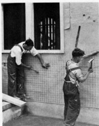
Special quality steel lath is used as a base for all stucco work.