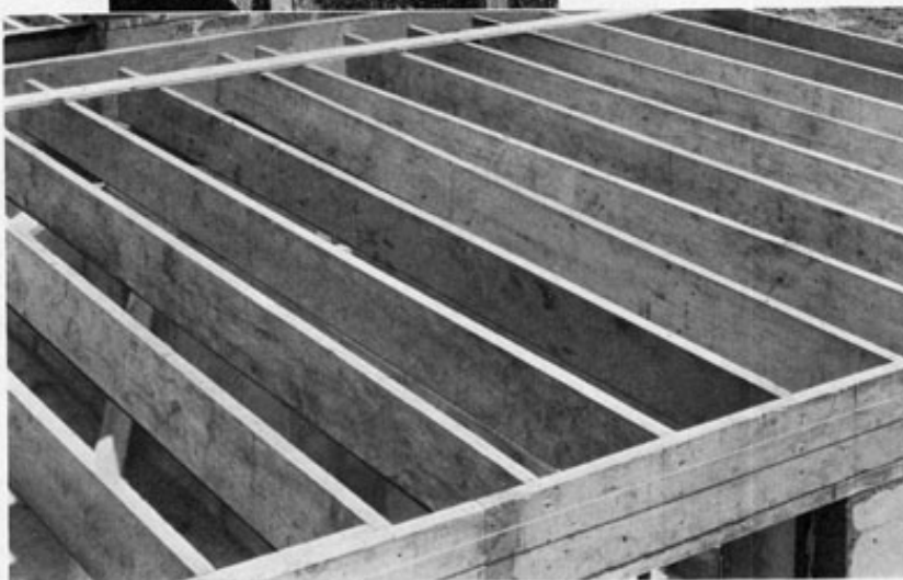
Two-by-tens, closely spaced, used for framing where ordinary two-by-eights might suffice, are indications of the high type of construction.