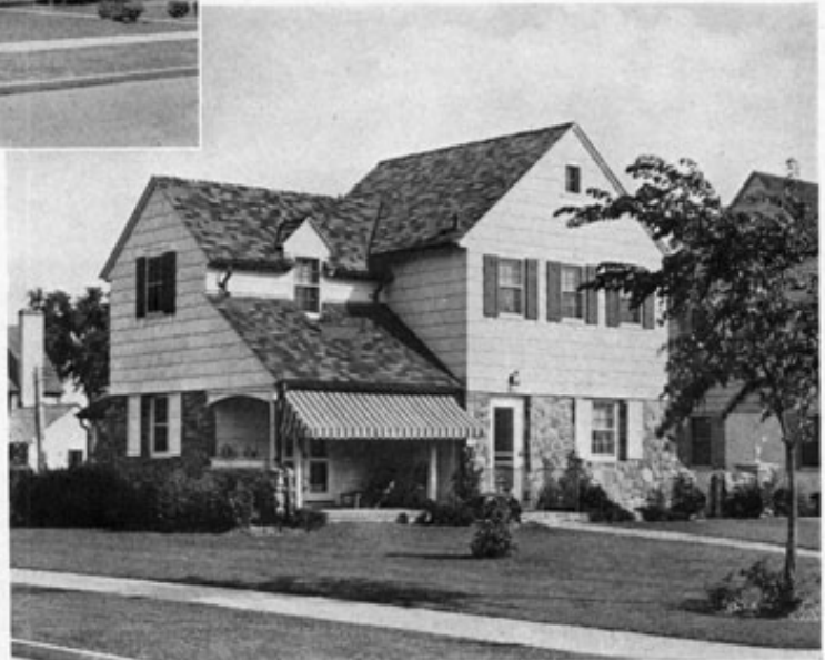
Moderately priced houses as carefully planned and built as one hundred thousand dollar homes.

homelike and permanent because it is of good design; and good design, like good architecture, defies time. It is always in style.