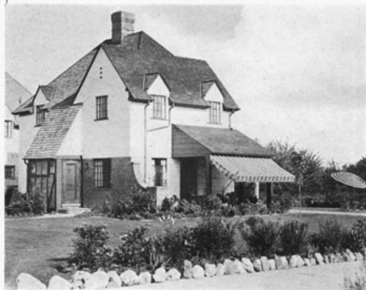
Outstanding examples of the best small house architecture of today.

Every detail, from the smart color combination of the roofs to the correct placing of the unique flagstone walks, adds value to an investment in Meadowbrook.